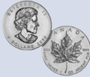
Canadian Maple Leafs

Visit our Website www.IndependentLivingBullion.com For a Complete Listing