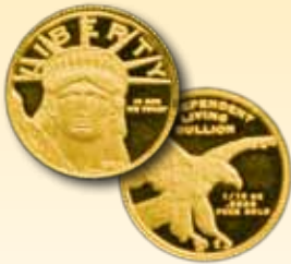
1/10-oz Lady Liberty Rounds