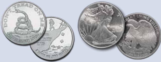
1-oz Silver Rounds