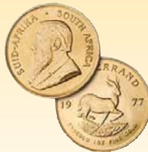
South African Krugerrands