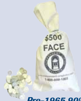
Pre-1965 90% U.S. Silver Coin Bags