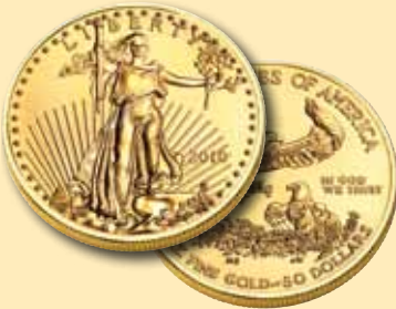
1-oz American Eagles