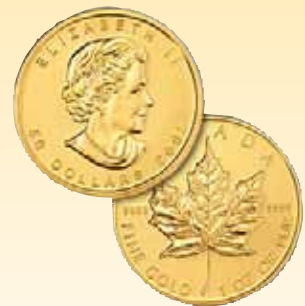
Canadian Maple Leafs