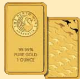
1-oz Perth Mint Gold Bars